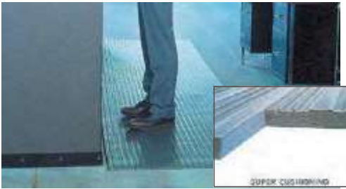
Colors: Black or Gray